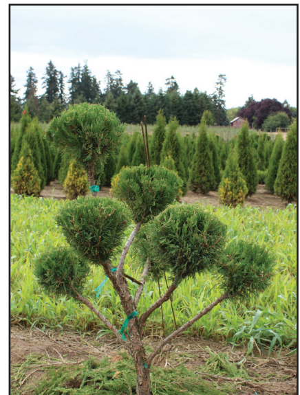
SEA GREEN POMPOM

17280 Boones Ferry Rd NE Woodburn OR 97071 (503) 981-7494 www.bountifulfarms.com