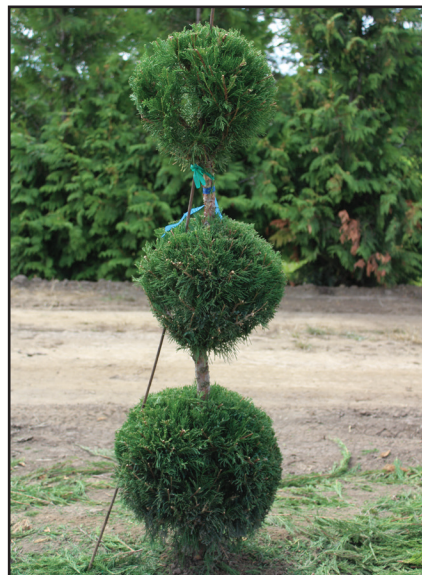
SEA GREEN TIER