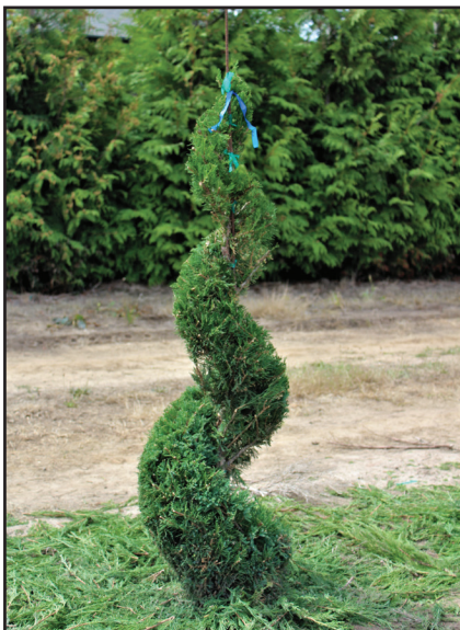
SEA GREEN SPIRAL

Whether clipped into a manicured shape or left to grow in its natural fountain-like habit, Sea Green Chinese Juniper adds a vibrant splash of color to the landscape. This color is especially notable in winter when its soft green matures to a deeper shade. Low maintenance and pollution tolerant, great for urban plantings. HxS 5'x7' Zones 4 to 9